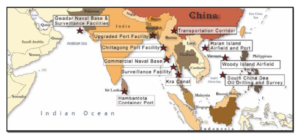
Source: The Joint Operating Environment (JOE) 2008. United States Joint Forces Command, Suffolk 2008, p. 28.

modernization, energy interests and quite clearly articulated goals, it is inevitable that it will seek to be an Indian Ocean player before long".<sup>29</sup> The Indian Ocean is an important factor for global trade, being a critical 'commerce highway', so control of sea lines of communication there is important to all Asian economies.<sup>30</sup> This is recognised by Robert Kaplan, who sees that China "wants to secure port access throughout the South China Sea and adjacent Indian Ocean, which connect the hydrocarbon-rich Arab-Persian World to the Chinese seaboard".<sup>31</sup> The rivalry between Beijing and New Delhi is peaceful, but the enlargement of the abilities of their navies' and air forces' to project power is an attribute that could cause willingness to challenge the opponent in the future.